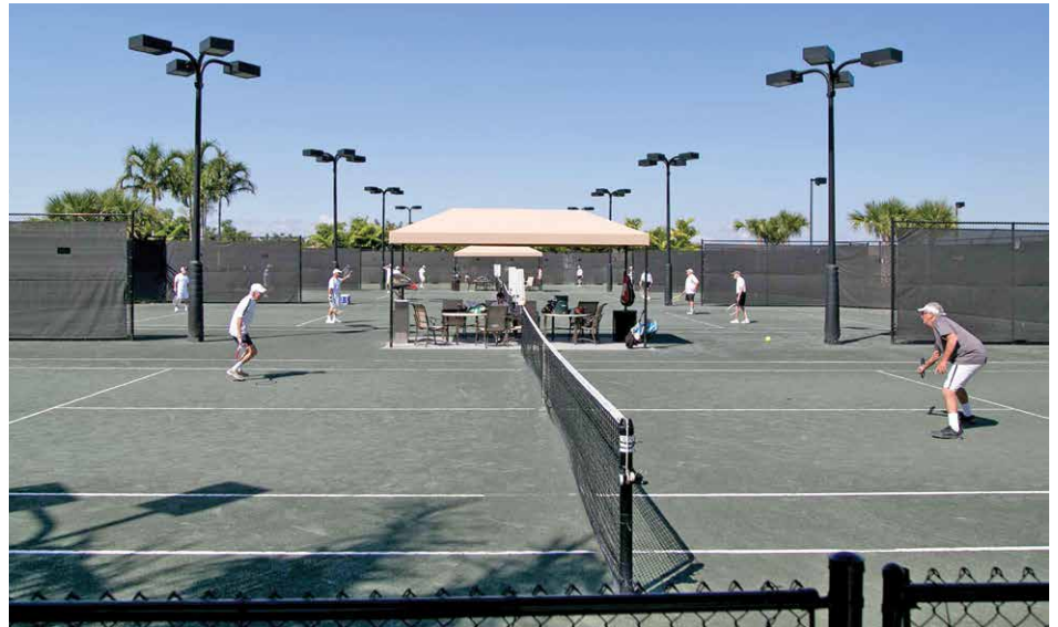
Nine tennis courts, three pools and a café surround the clubhouse at Valencia Reserve in Boynton Beach.